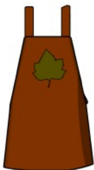
TABLIER DU JARDINIER